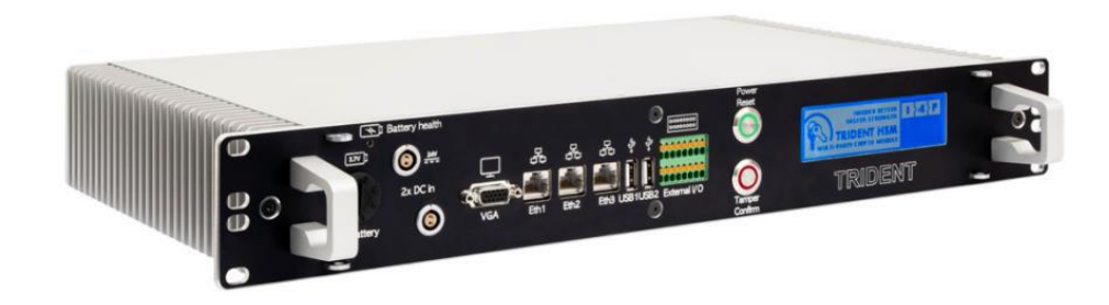
Figure 1 - Physical appearance of an MPCA

Depending on its configuration, the TOE consists of one, two, three or four MPCAs (Multi-Party Cryptographic Appliances). An MPCA comes in the form of a metal, rack mountable box (see Figure 1).